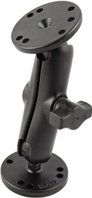
Suction Mount (extra)